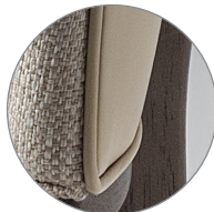
Piping Detail / Detalle ribete