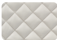
TX2 Diamond Quilted