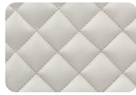
TX2 Diamond Quilted