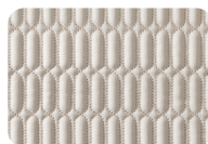
TX3 Heritage Quilted